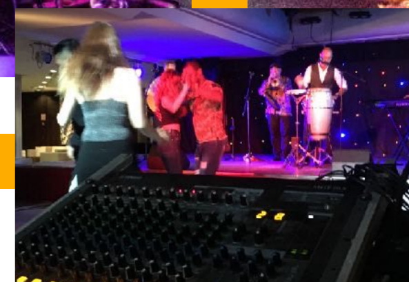
Habana (audio demo with female singer)